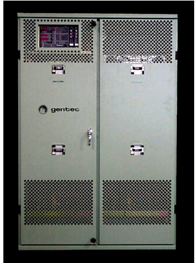
Redundant Battery Charger 125 VDC, 150 A