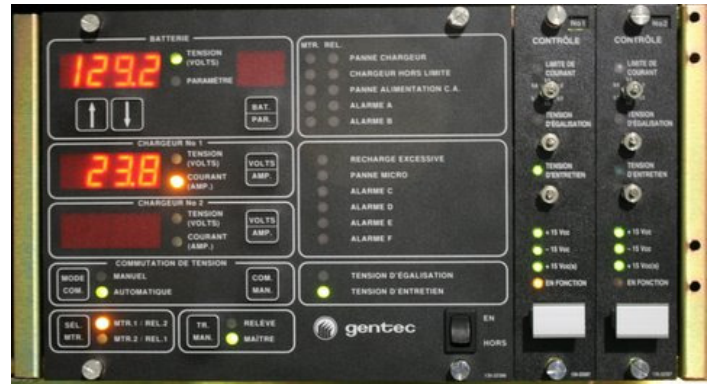
Display Module and Control Cards

Any of these conditions may easily be set to "ON" or "OFF", or configured on-site with the "Parameter" mode available on the display module.